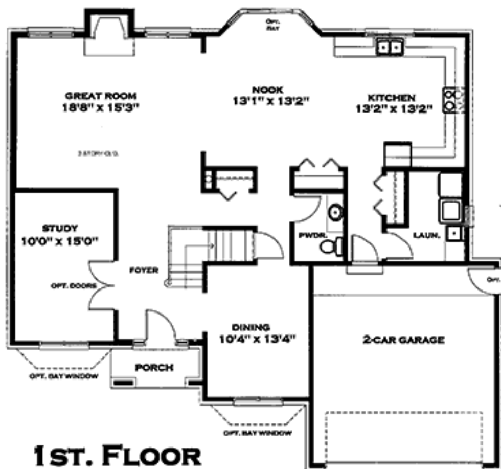
1ST. FLOOR PLAN